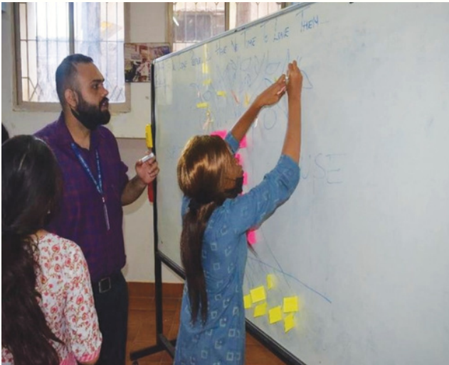
Awareness on Drug Abuse: