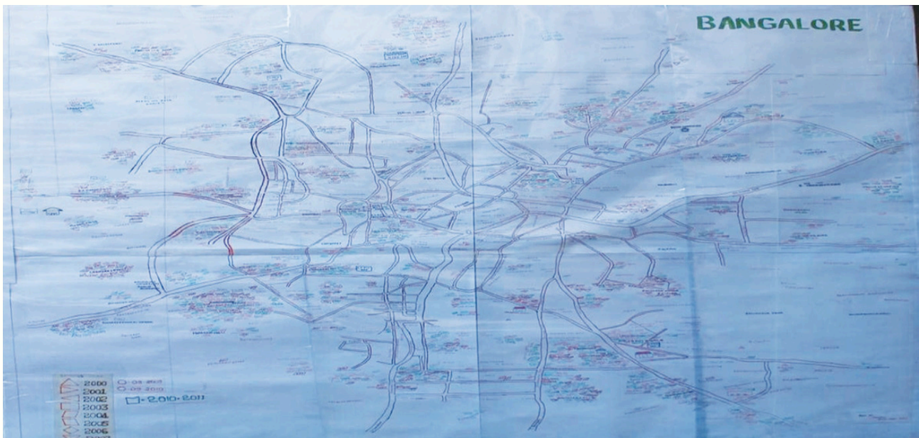
A map of Bengaluru City indicating the crime prone areas marked in red

ECHO conducted a comprehensive data collection across all police stations in Bengaluru in the year 2000, specifically focusing on recorded juvenile crimes within their respective jurisdictions. Subsequently, the Social Workers of ECHO meticulously mapped these crimes to pinpoint areas with a higher incidence of juvenile offenses. This data-driven approach served as a valuable tool in establishing a Crime Prevention Center in the identified juvenile crime-prone areas.